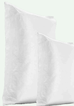
Plastic Sacks (10, 25, 50 Kg)