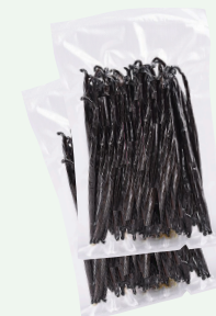
Vacuum Plastic (1, 2, 5 Kg)