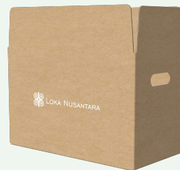
Dobel Wall Box (Customized with size (cm))