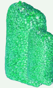
Mesh Bag (10, 25, 50 Kg)

You can request the packaging available. Custom design and logo if you partner as White Labeling