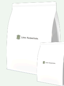
Standing Pouch (Up to 10 kg)